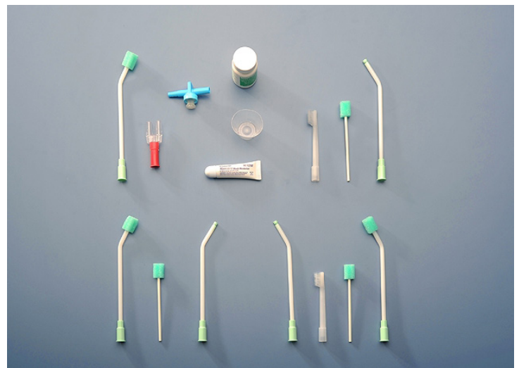
Oral Care Kit, Item No. 9001618